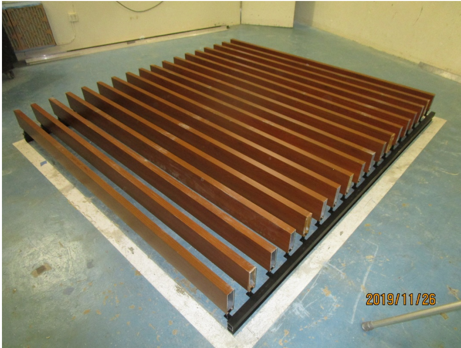
Figure 1 – Specimen mounted in test chamber