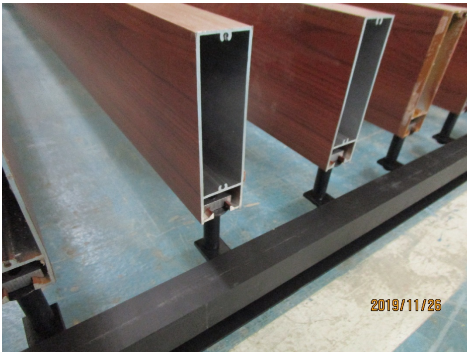
Figure 2 – Cross sections of individual beams, mounting method