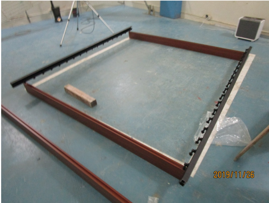
Figure 3 – Specimen inverted, partially constructed; mounting rails