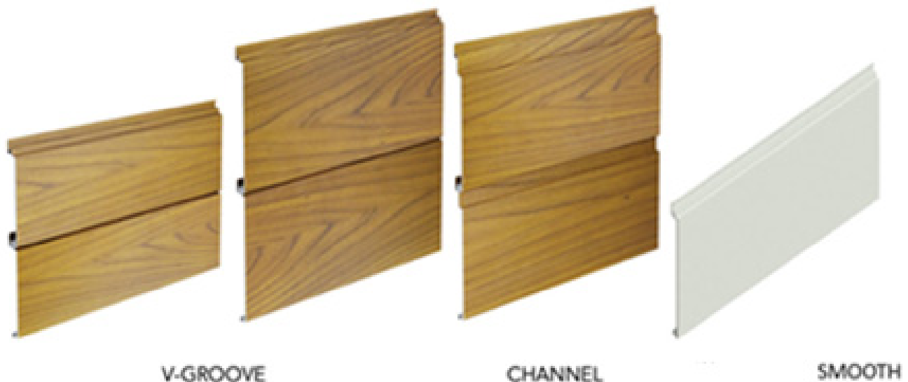
FIGURE 1—LONGBOARD SIDING WITHOUT CONTINUOUS RIB

MAYNE COATINGS CORPORATION 27575 50 AVENUE LANGLEY, BRITISH COLUMBIA V4W 0A2 CANADA (604) 607-6630 www.longboardproducts.com info@longboardproducts.com