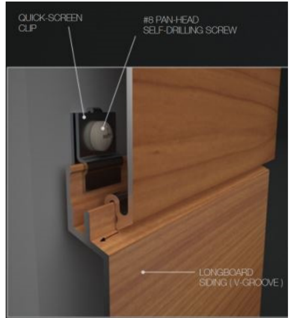
FIGURE 2—QUICK-SCREEN™ CLIP